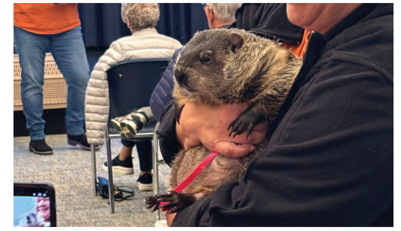
Members of Acorn Acres Wildlife Rehabilitation brought two groundhogs, Elliott and Lilly, to campus as part of a special presentation on Groundhog Day on Feb. 2, 2026.