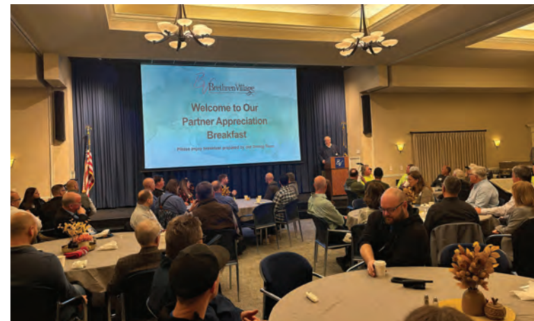
More than 100 business partners attended BV's annual Partner Appreciation Breakfast on Nov. 6, 2025.