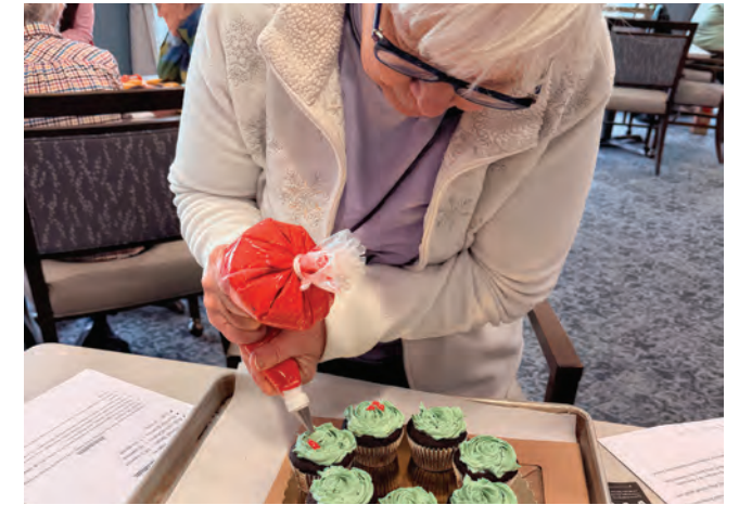
Residents created cupcake wreaths before the holidays on Dec. 8, 2025.