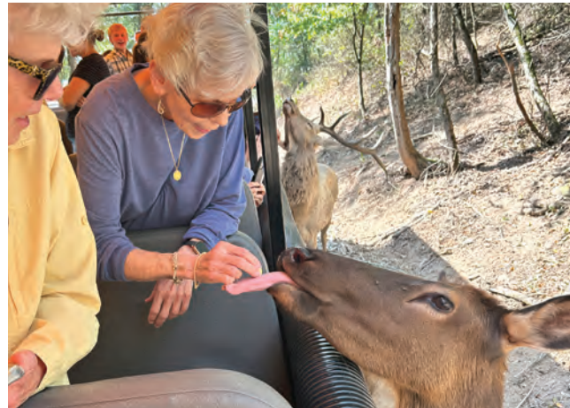
It was a wild time at Lake Tobias on Sept. 6, 2025.