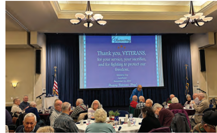
BV honored those who served our country during the Veterans Day luncheon on Nov. 11, 2025.