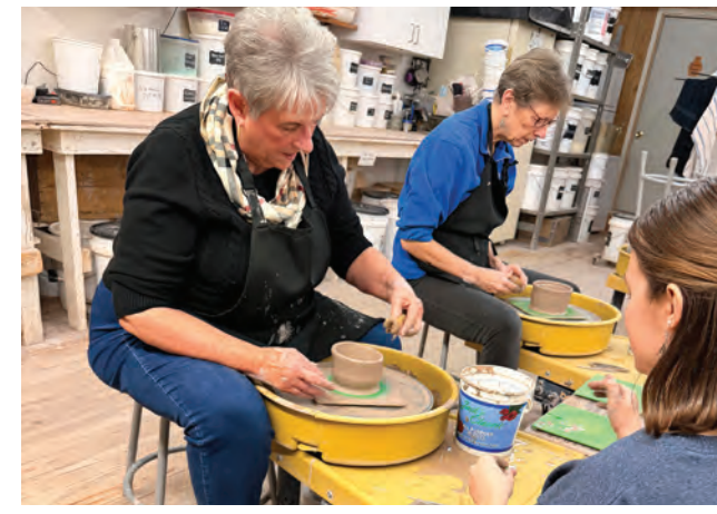
Residents created handmade bowls during a trip to Inspire Pottery Studio on Jan. 13, 2026.