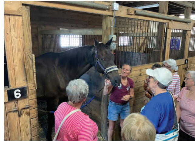
Residents enjoyed the horses at Ryerss Farm for Aged Equines on Aug. 22, 2025.