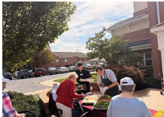
Residents enjoyed the autumn temperatures and dining al fresco during Fall Fest on Oct. 3, 2025.