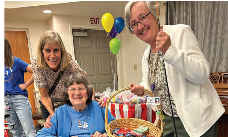
Residents in Village Manor and Terrace Crossing enjoyed an indoor carnival on Sept. 10, 2025.