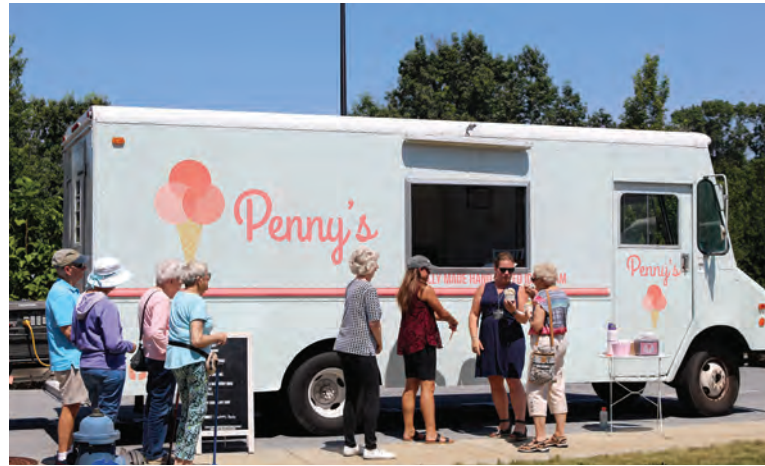
Residents enjoyed Penny's Ice Cream on Aug. 11, 2025.