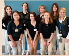
Partner Profile – Meet the Symbria Team at Brethren Village