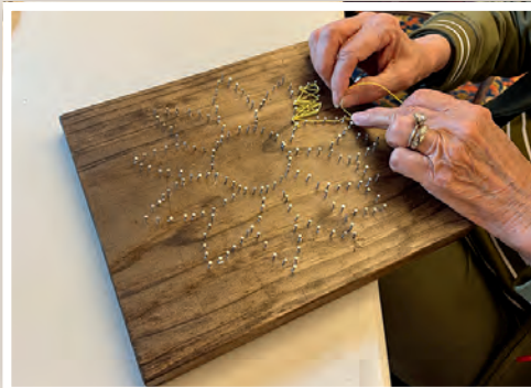
Campers had a chance to try their hand at a variety of crafts including flower string art, making a painted succulent flower pot and decorating cup cakes.

What's more fun than summer camp? Residents enjoyed the second annual Brethren Village Summer Camp in June. In addition to the elements that everyone loves about summer camp – camp food, singing, games, swimming – attendees had an opportunity to think about who is their neighbor through daily inspirational meditations. And, they had a chance to put into action caring about their neighbor through service trips to Lancaster Food Hub, COBYs and Mennonite Central Committee.