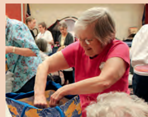
BV Annual Summer Camp