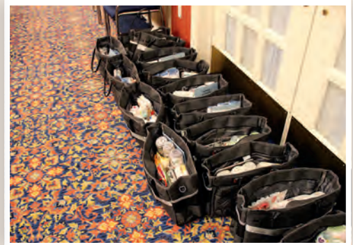
Residents packed care bags for people being served by the North Star Initiative and House of His Creation. They also wrote notes to women in these programs.