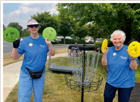
Campers played games such as disc golf, cornhole and board games.