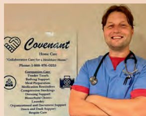
Partner Profile - Covenant Home Health & Home Care