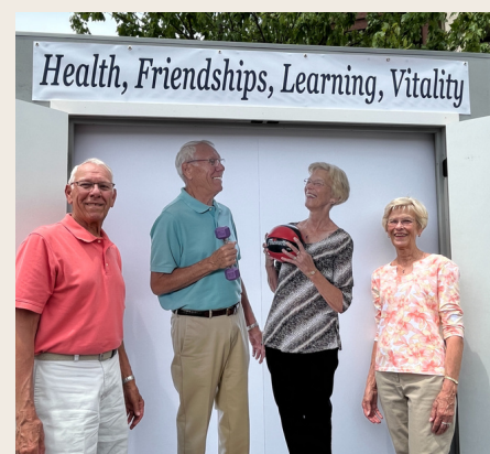
Construction launch celebration June 2023