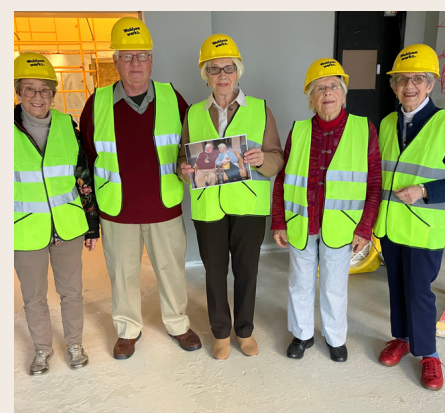
Residents on a hard hat tour during construction