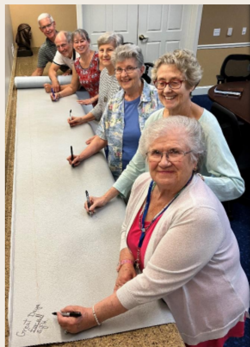
Communications Committee members were the first to sign the time capsule!