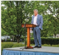
What Our Partners Say