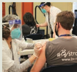
Team Members receive their COVID-19 Vaccine