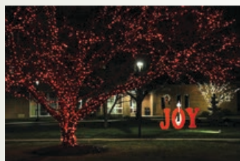
BV campus was illuminated with thousands of lights