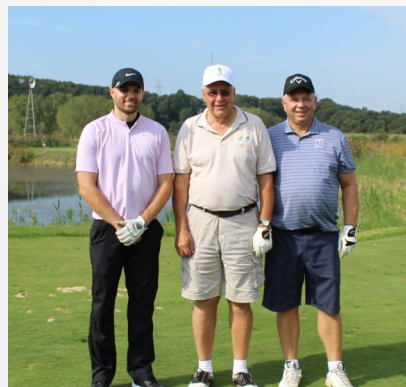
29th Annual Golf Tournament