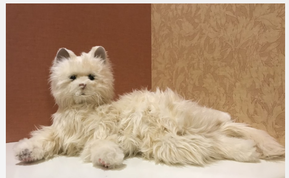
Joy for All Companion Pet— aka Robo Kitty

Thanks to underwriting support, Therapeutic Recreation in The Courtyards, was able to purchase the Joy for All Companion Pet, that is shown to the right. These cats respond to putting, hugging and motion like a real cat would. This addition to the Wish List was suggested by a Team Member, as an item that will bring joy and comfort to our Residents. It is well used and seems that the name fits.