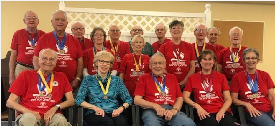
BV Senior Games Medal Winners