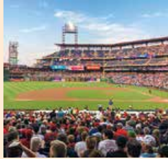
Elite Bus Trip To Citizens Bank Park

BV BrethrenVillage 3001 Lititz Pike, Lititz, PA 17543