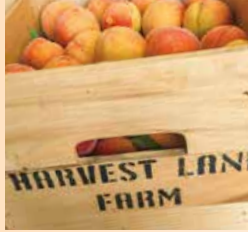
Partnership with Harvest Lane Farm