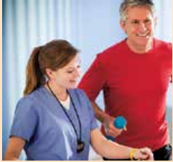
The Rehabilitation Center at BV