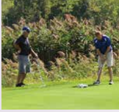
BV's 28 th Annual Golf Tournament