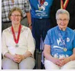
2018 Senior Games