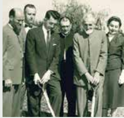
Generosity 100 Years In The Making