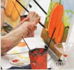
Enrichment At Brethren Village