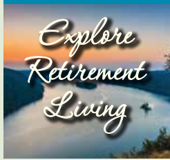
7th Annual Open House Event