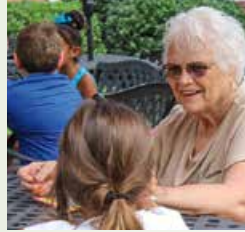
BV Resident & U-Gro Pen Pal Program