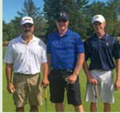
Register for Brethren Village's 27th Annual Golf Tournament