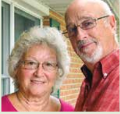
Enjoying the Ride at BV