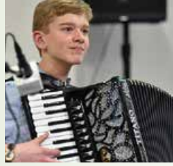
Good Samaritan Banquet