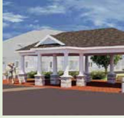
Northside Court is Under Construction