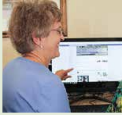
BV Residents Embrace Technology