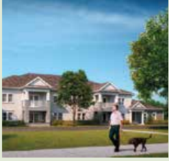
BV Announces Northside Court