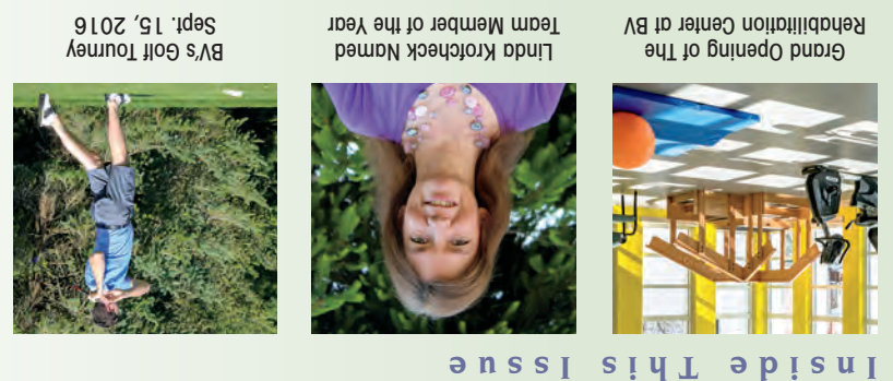
BV's Golf Tourney Sept. 15, 2016

Brethren Village 3001 Little Pike, P.O. Box 5093 Lancaster, PA 17606-5093 RETURN SERVICE REQUESTED