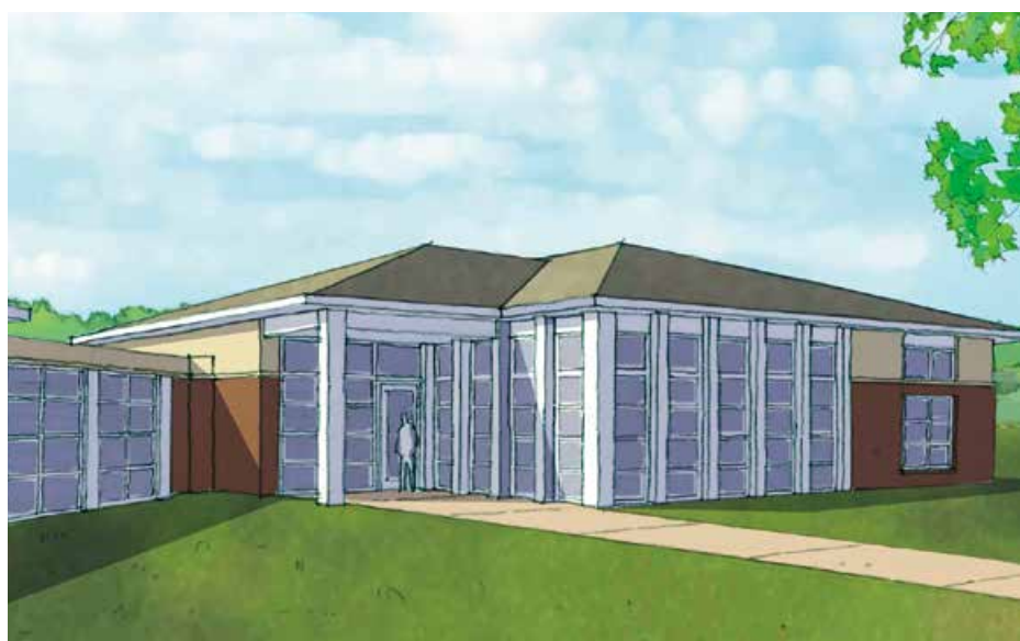
Exterior rendering of The Rehabilitation Center at Brethren Village.

Be one of the first to see the new short term rehab building at Brethren Village! Check our website later this fall for details on our short term rehab open house dates: www.bv.org