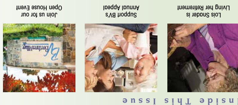
Inside This Issue