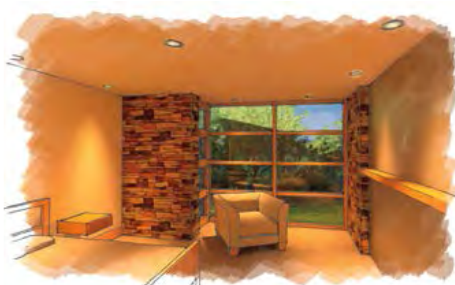
Resident Room Concept

Construction has begun to transform the Garden Spot building (next to The Courtyards) into a 20 bed, Medicare-licensed short term rehabilitation facility. Residents, or members of the community, who are recovering from surgery or an injury can be cared for at our dedicated rehab center. The on campus short term rehab will complement the care administered at The Courtyards by separating those who need recovery care from Residents requiring long term nursing care. Additionally, the short term rehab building will house inpatient/outpatient therapy with a separate entrance and its own signage. All rooms are private with the anticipated length of stay being 20 days or less. One aspect that makes BV's short term rehab unique is that our Choice+ support services team will make an at-home visit to each discharged Resident/patient to ensure their needs are being met. The projected grand opening is January 2016, when we look forward to offering you even more choices!