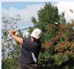
Golf Tourney 2012