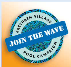
Join the Wave Pool Campaign