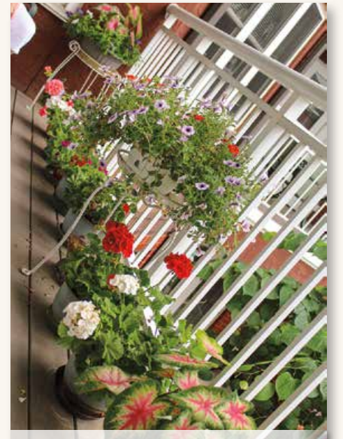
The Theros' potted balcony garden

If you love gardening and welcome the extra time to be able to care for flowers and plants, you may want to contact the Green Thumb Society. They are always looking for volunteers to help with campus weeding and care of the Pollinator Meadow. Of course if you moved to BV so that you wouldn't have to maintain outdoor areas anymore, don't worry! Our grounds crew will maintain everything for you. The choice is always yours.