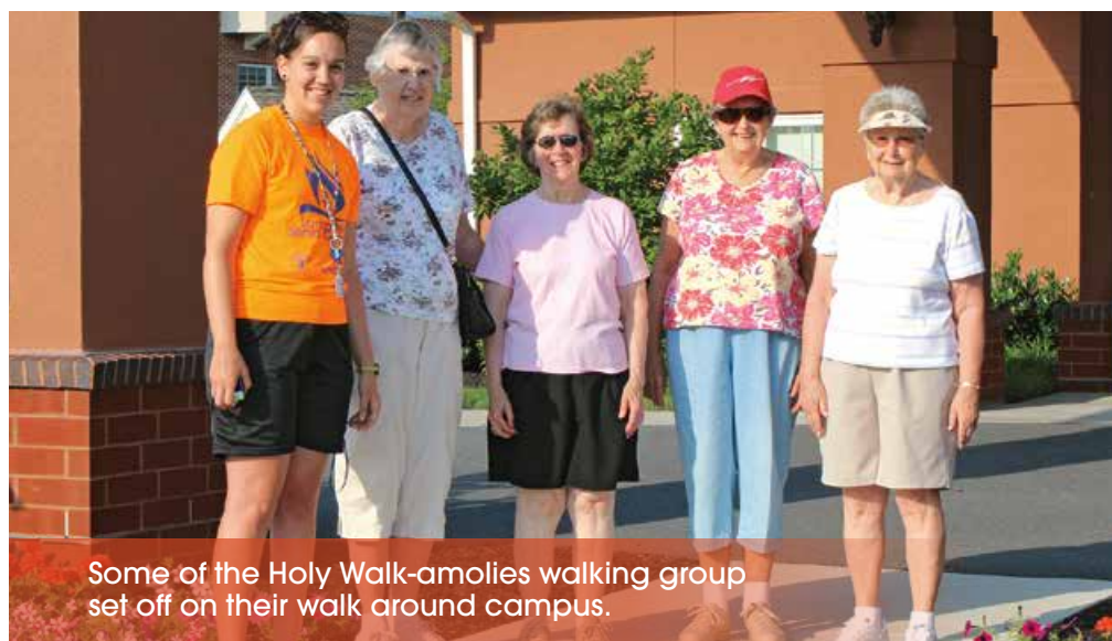
Some of the Holy Walk-amolies walking group set off on their walk around campus.