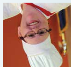
BV's First-Ever Iron Chef Competition