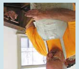
The Resident Workshop Turns 10