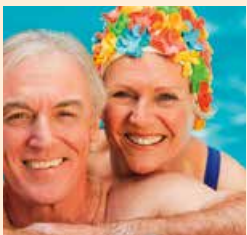
Goal reached for new pool project