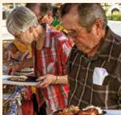
Residents gather for Summer Soiree