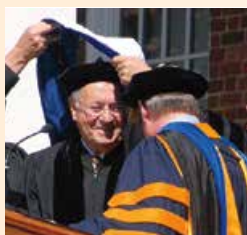
Past BV Board Chair receives honorary degree