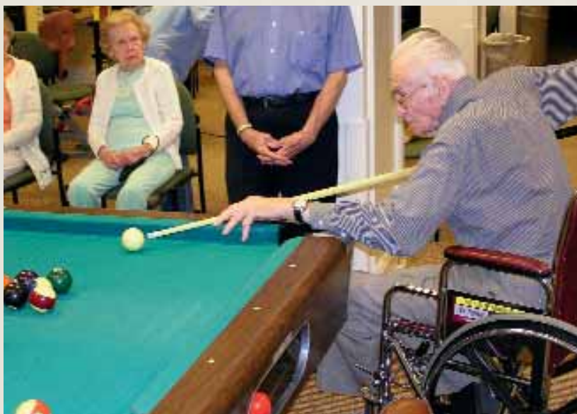
Organized by Therapeutic Recreation, Village Manor residents are joined by team members and independent living residents in an afternoon of billiards in Village Townhouse.