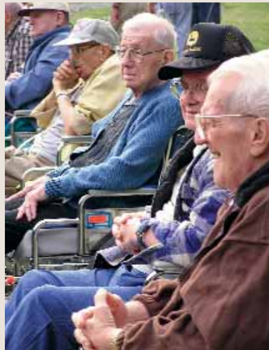
Gearing up to fish, Village Manor and Healthcare Center residents anxiously await their bait and hooks at the September Men's Fishing Trip to the Arrowhead Springs Trout Hatchery in Newmanstown.