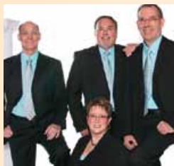
Keystone State Quartet to Headline Banquet