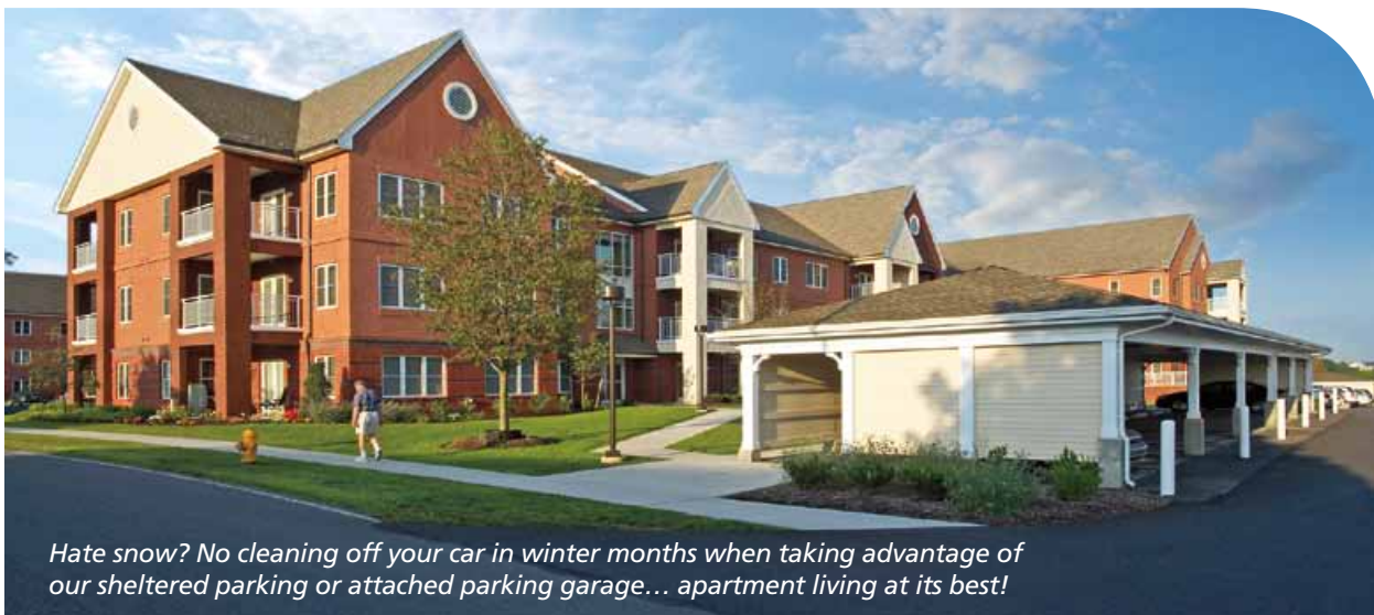
Hate snow? No cleaning off your car in winter months when taking advantage of our sheltered parking or attached parking garage... apartment living at its best!

A new rental program is available in select apartments on a limited basis. No entrance fee required!