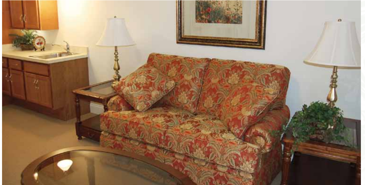
Terrace Crossing personal care two-bedroom unit features 941 square feet, a spacious, well-designed floor plan, a private full bath and cozy kitchenette.

(Please note . . . All listed events are open to the public!)