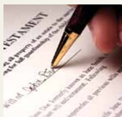
Leaving A Legacy!