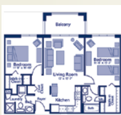
Tour a Fieldcrest Redwood Apartment!